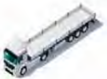
12 Mt. Flatbed Trailer