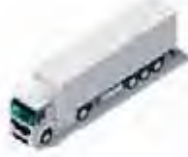
13.6 Mt. Box Trailer