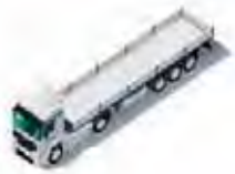
13.6 Mt. Reefer Trailer