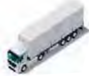
13.6 Mt. Curtain Trailer